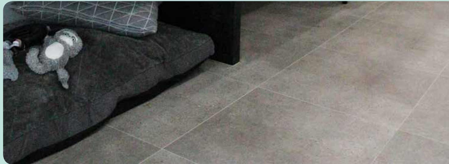
600 x 600 Porcelain Floor Tiles to Common Ground Areas from our Classic Range