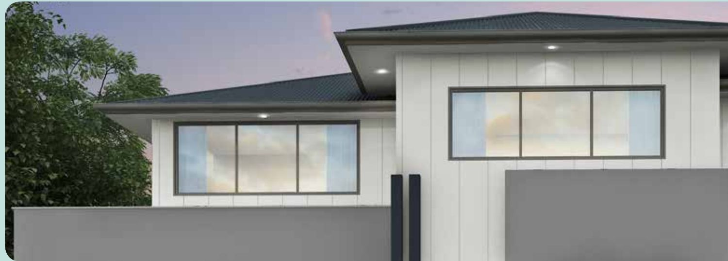
2kW Solar panel System