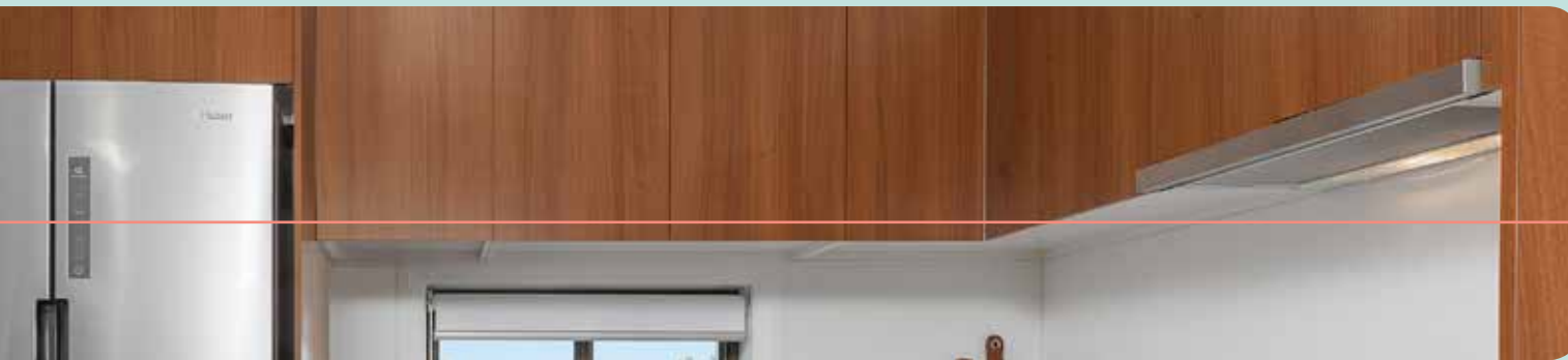
900mm Canopy Rangehood

And as standard with Meridian Homes, your path and driveway is included in your new home.