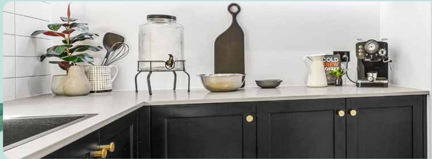
20mm Stone Benchtop to Kitchens from our Classic Range