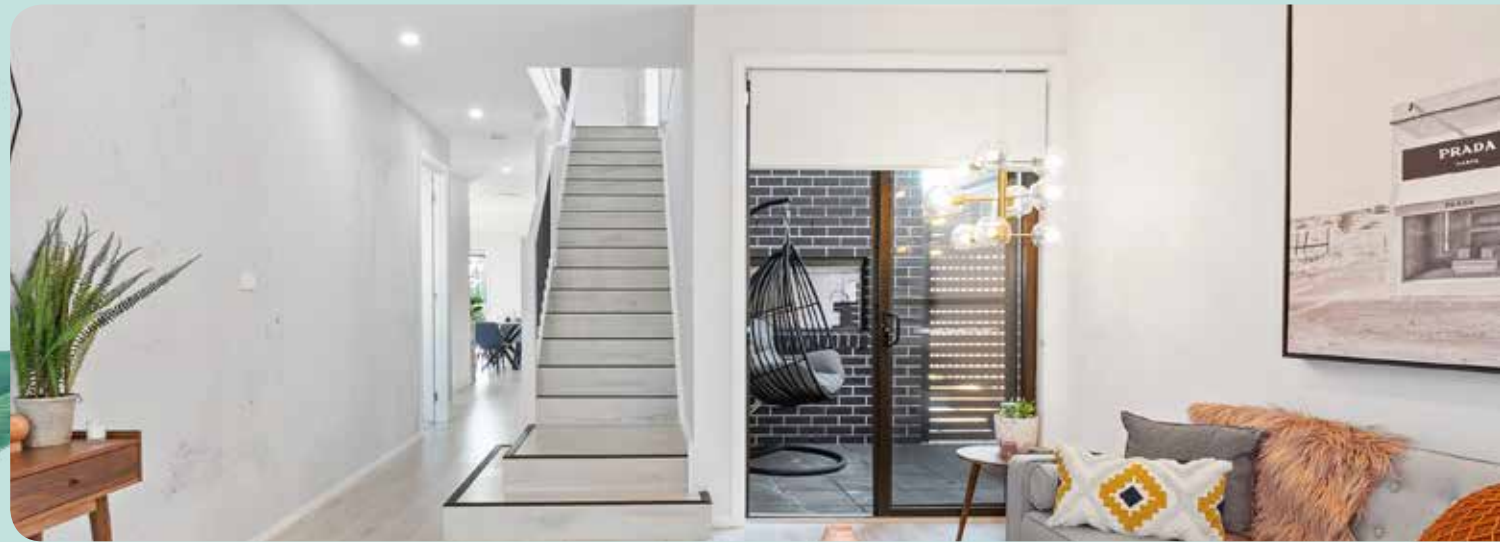
2600mm ceiling to ground floor.