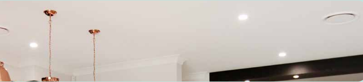
Dakin 12.5kW Inverter Air Conditioner to keep you cool