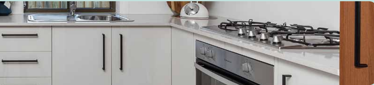
900mm gas Westinghouse cooktop

And as standard with Meridian Homes, your path and driveway is included in your new home.