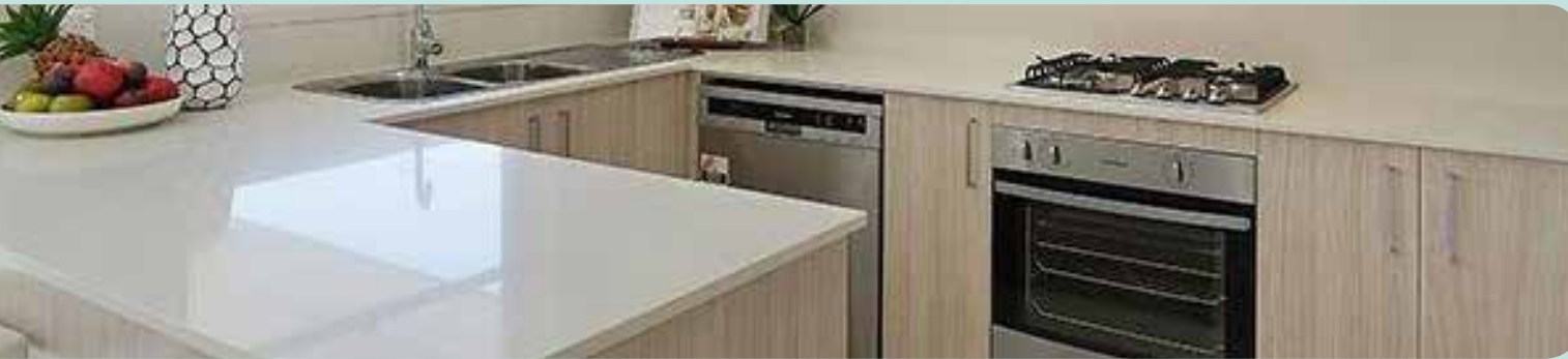
Dishwasher in Kitchen