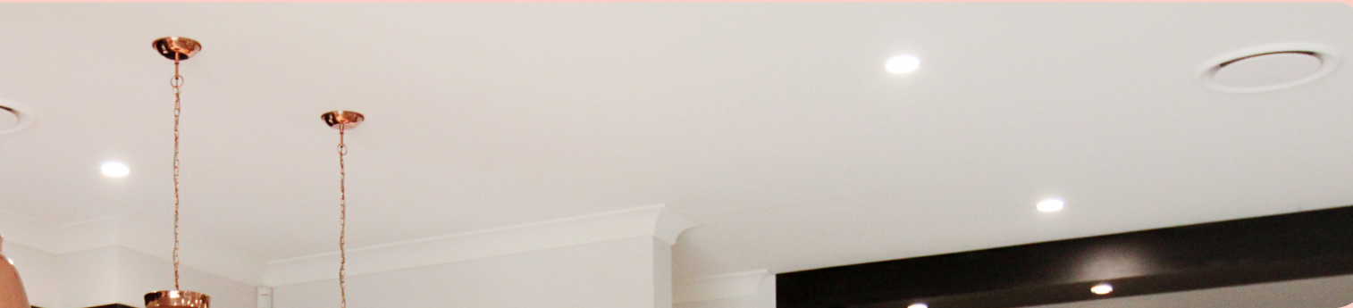
Dakin 12.5kW Inverter Air Conditioner with a Dakin Zone Controller to keep you cool