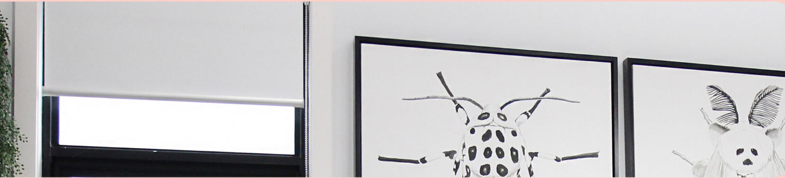
Roller Blinds to windows in your selected colour