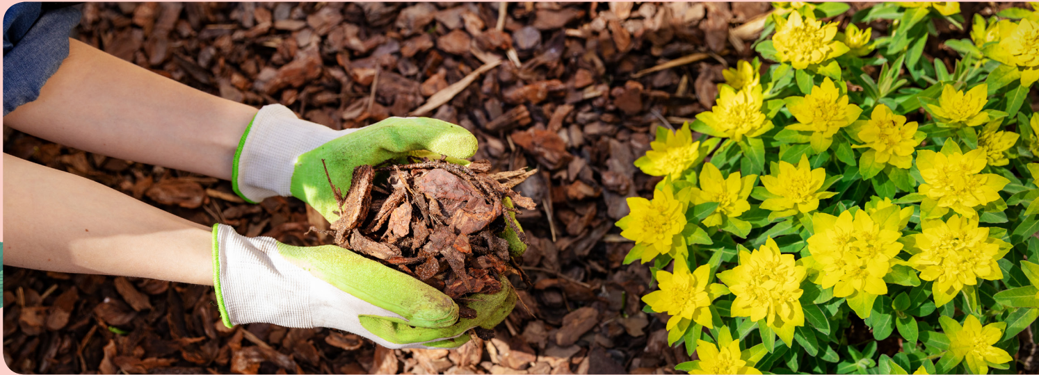
Soft Landscaping packaging including turf to front and backyards and plants as selected by Meridian Homes