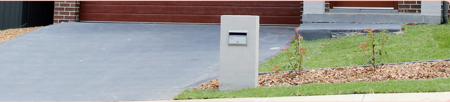
Letterbox and clothesline in your selected location

And as standard with Meridian Homes, your path and driveway is included in your new home.