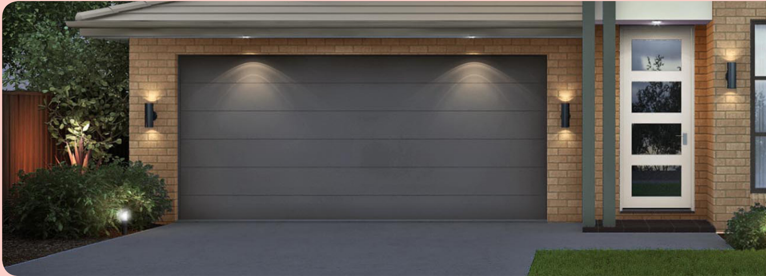
Colorbond fencing and one gate in your selected location

Disclaimer: All images are used for Marketing purposes only and may not be indicative of final product. Please note the published price is based on the inclusions set out in the specifications attached to this Brochure. Speak to one of our consultants at the display home or call 1300 855 138 if the specification is missing or if you require further clarification.