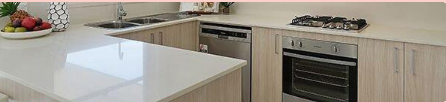
Dishwasher in Kitchen