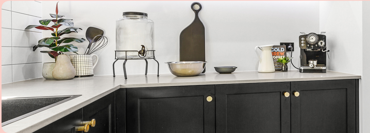
20mm Stone Benchtop to Kitchens from our Classic Range