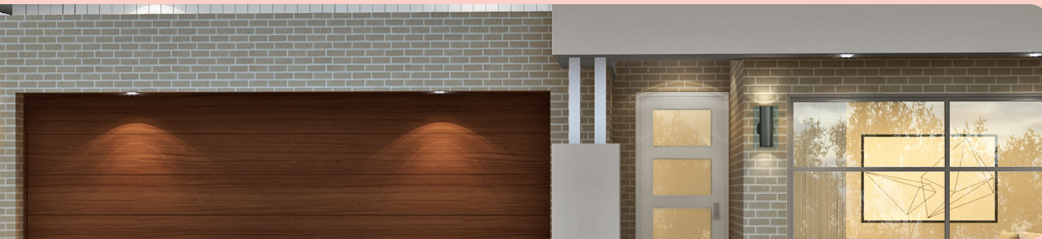
3 Sensor Alarm System for added security to your home

And as standard with Meridian Homes, your path and driveway is included in your new home.