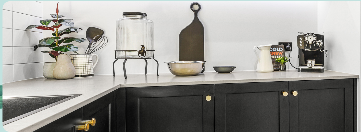
20mm Stone Benchtop to Kitchens from our Classic Range