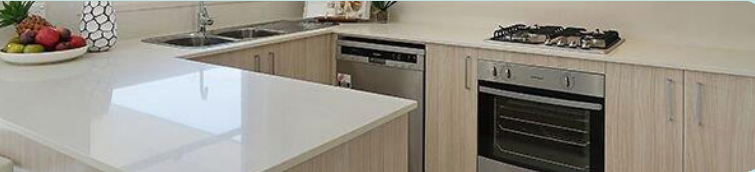
Dishwasher in Kitchen