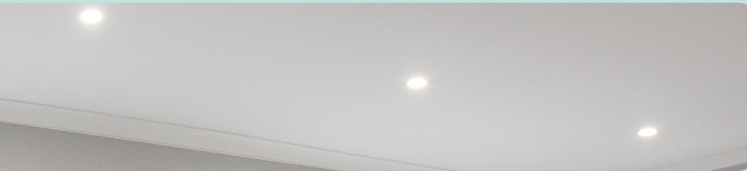
10 LED Downlights in lieu of oyster lights