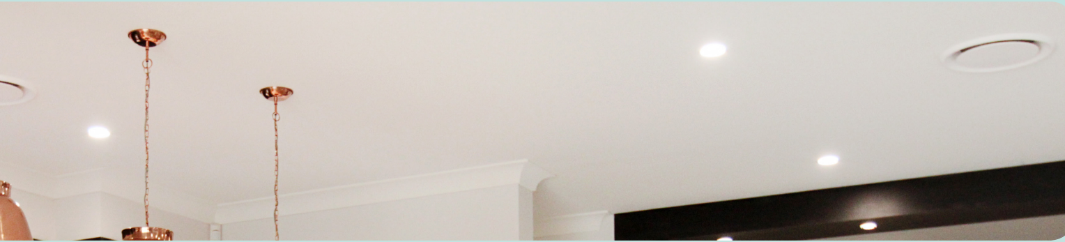
Dakin 12.5kW Inverter Air Conditioner to keep you cool