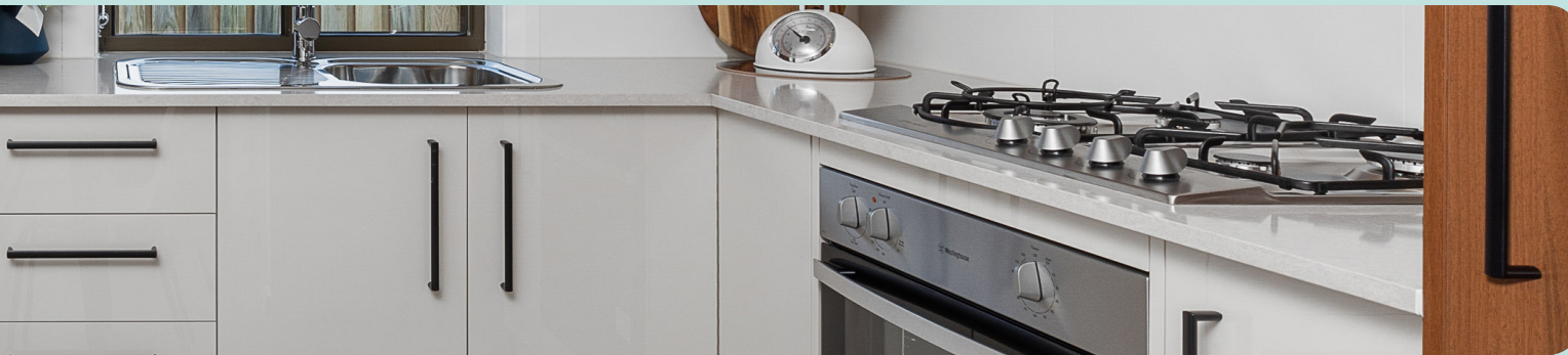
900mm gas Westinghouse cooktop

And as standard with Meridian Homes, your path and driveway is included in your new home.