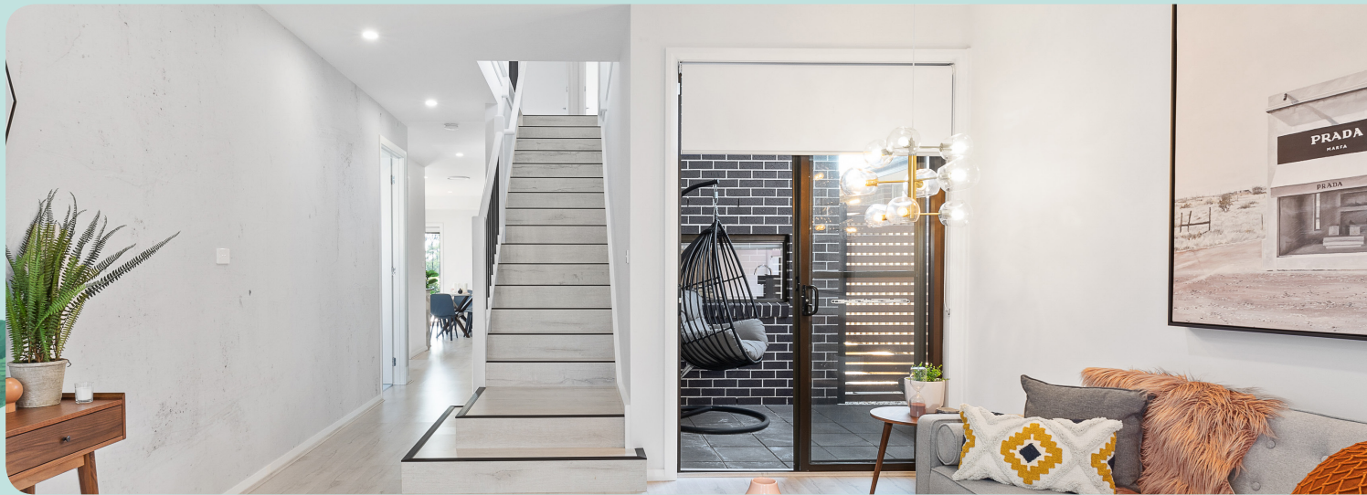
2600mm ceiling to ground floor.