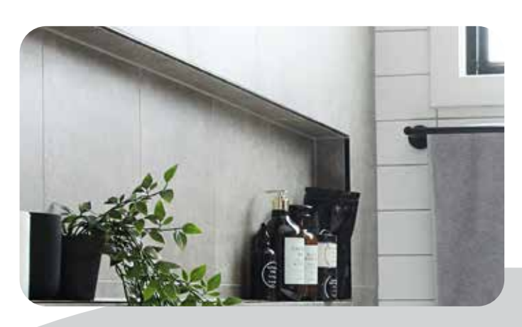
Shower Niche in Bathroom and Ensuite