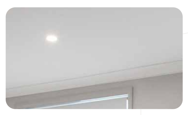
10 LED Downlights in lieu of oyster lights