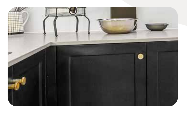
20mm Stone Benchtop to Kitchen