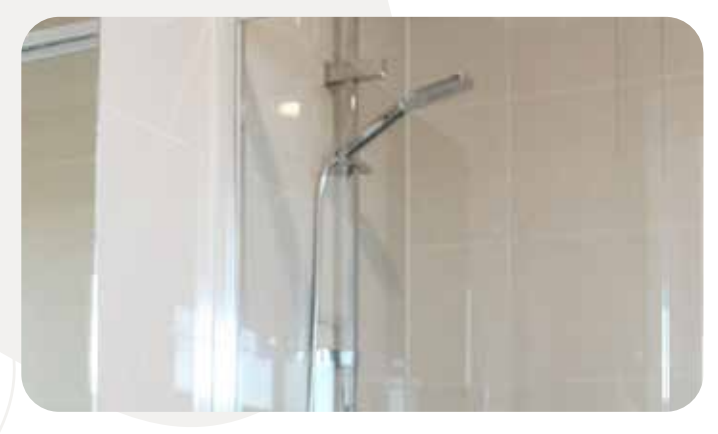
Hand Held Shower in Chrome in Bathroom and Ensuite