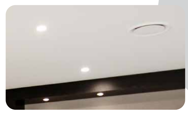
Dakin 12.5kW Inverter Air Conditioner with a Dakin Zone Controller to keep you cool