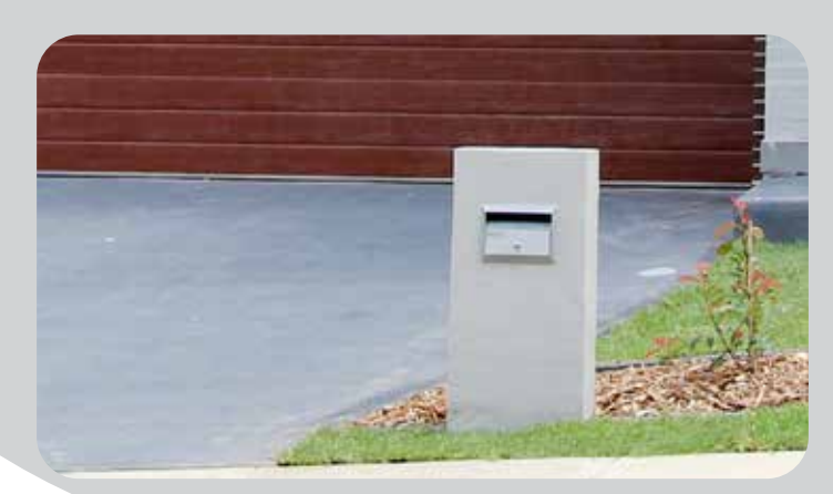
Letterbox and Clothesline