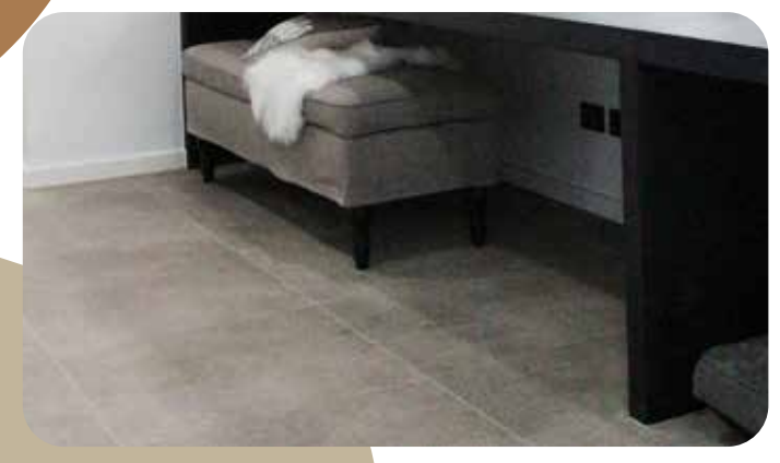
Laminate Floorboards or Porcelain Floor tiles to Common Ground Areas from our Classic Range