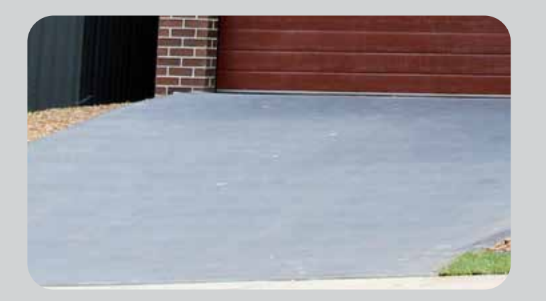
And as always, your driveway is included standard as part of your new home