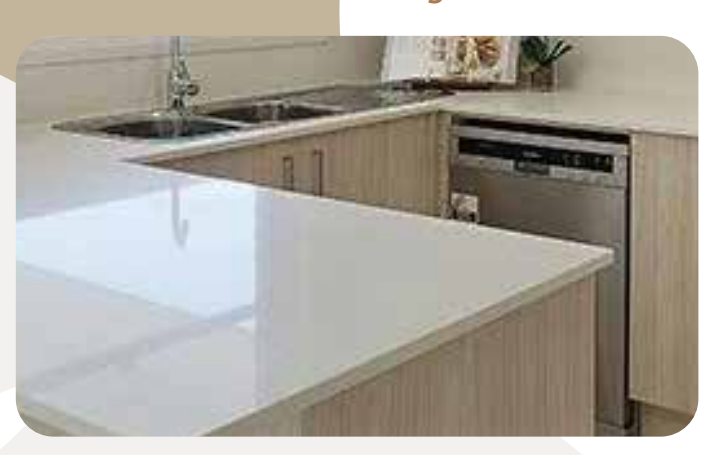
Dishwasher in Kitchen