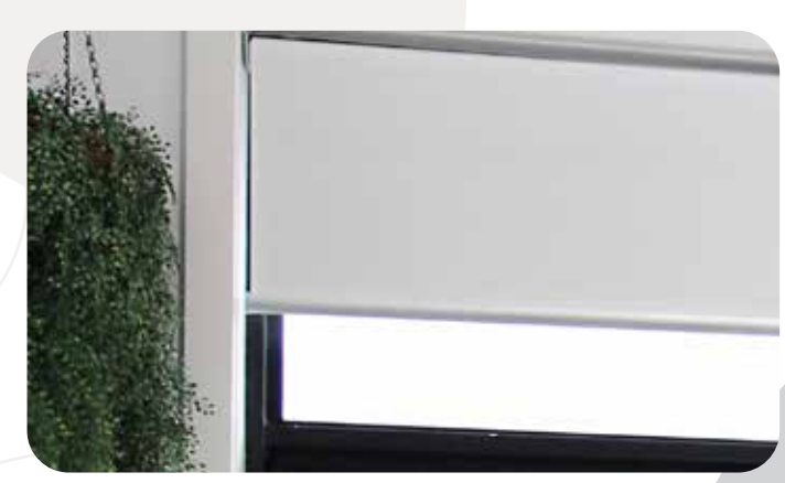
Roller Blinds to windows in your selected colour from our classic range