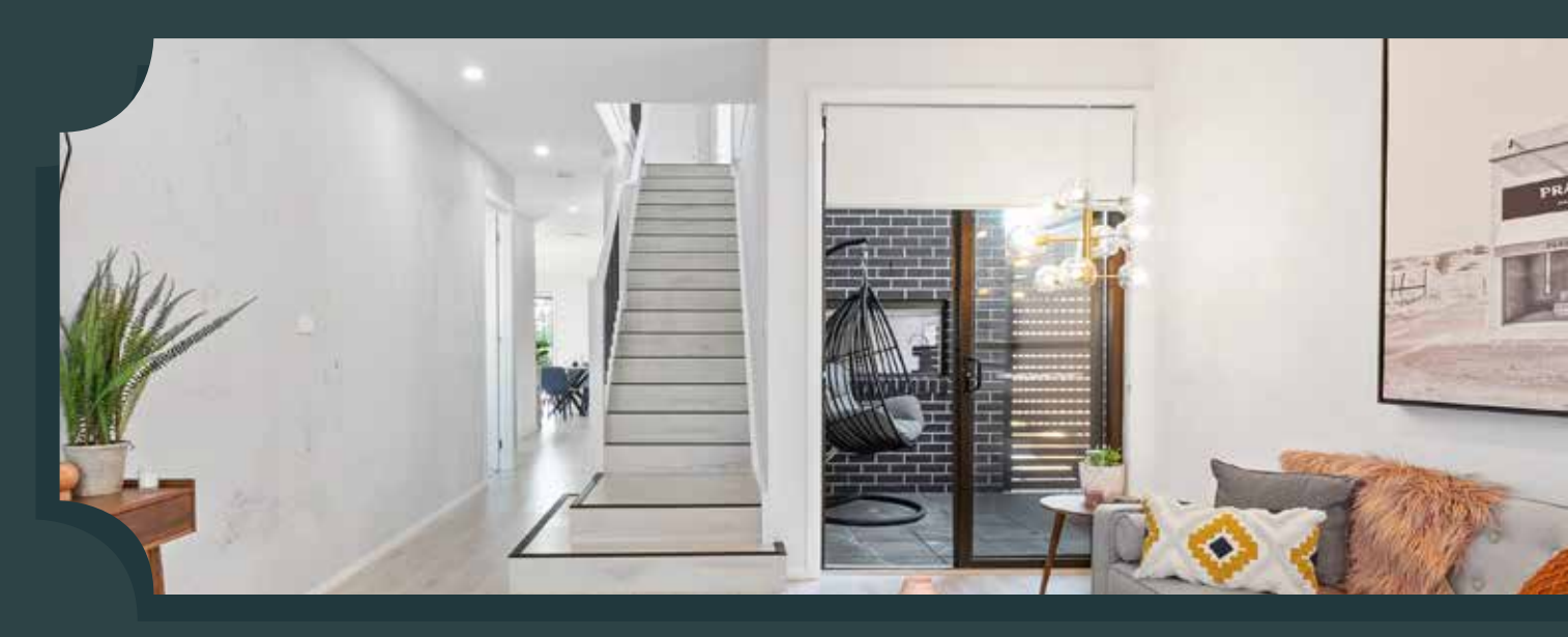
2600mm Ceilings To Ground Floor