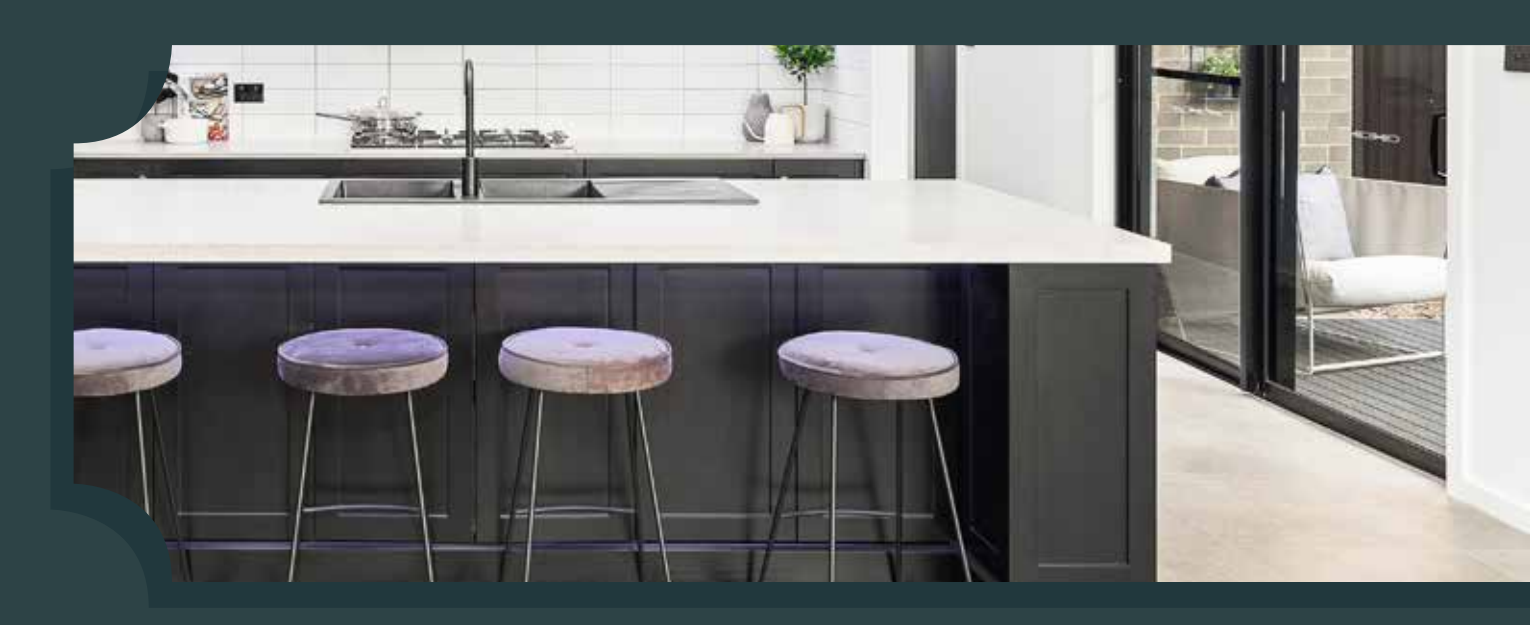
900mm Westinghouse Canopy Rangehood