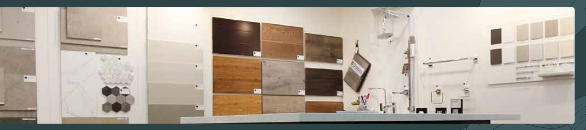
$1500 Colour Studio Voucher