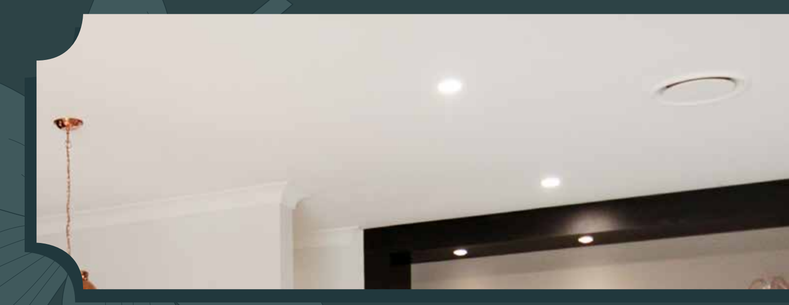
Dakin 12.5kW Inverter Air Conditioner with a Dakin Zone Controller with Dual Zones and 8 outlets