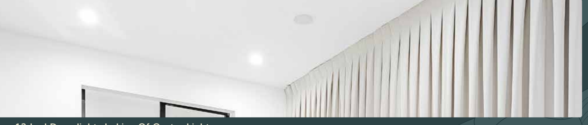
12 Led Downlights In Lieu Of Oyster Lights