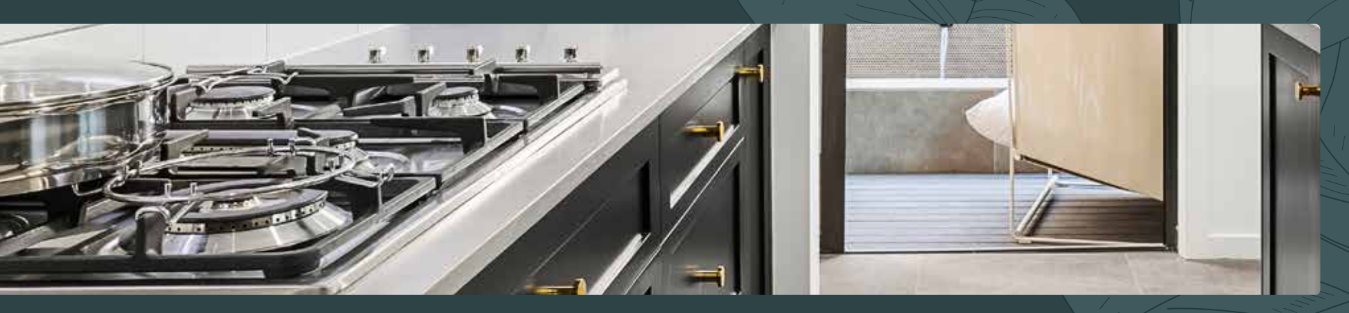
900mm Westinghouse Gas Cooktop