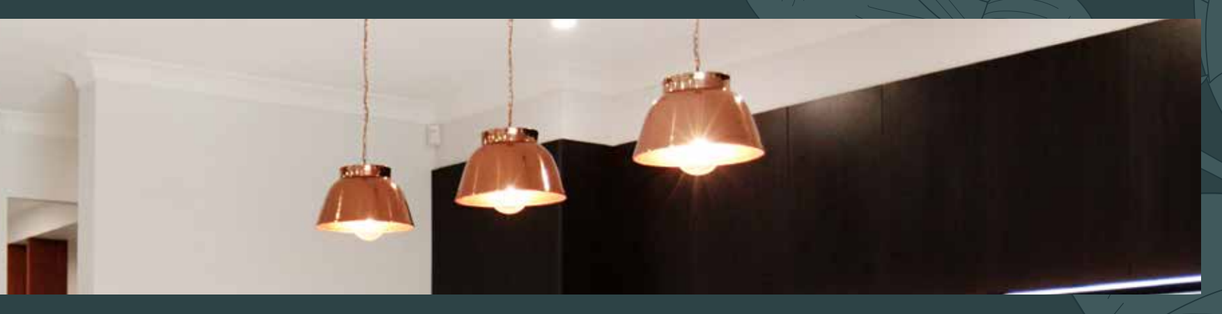
3 pendant lights in Kitchen