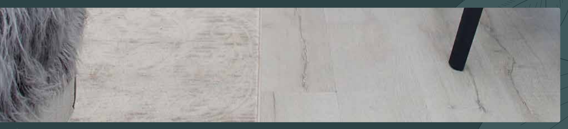
$5000 Flooring voucher