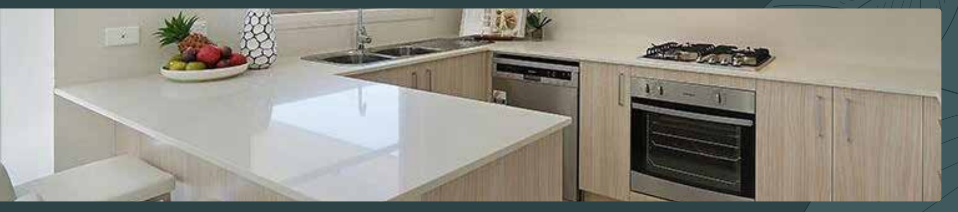
Westinghouse Dishwasher In Kitchen