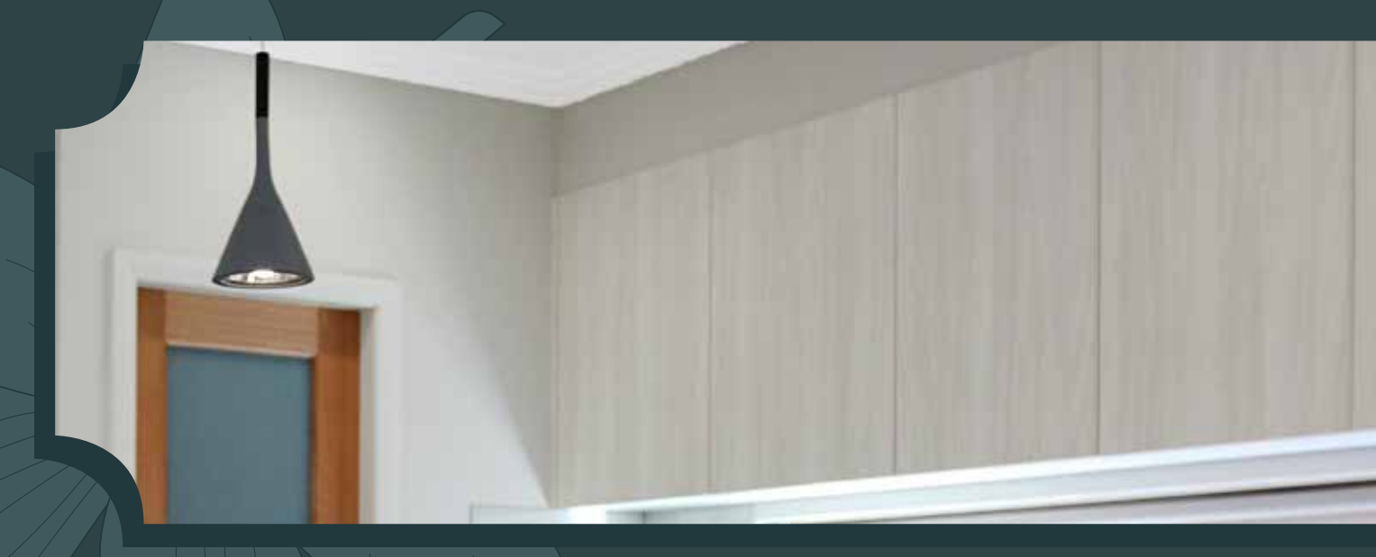
Soft Close Cupboards and Drawers in kitchen